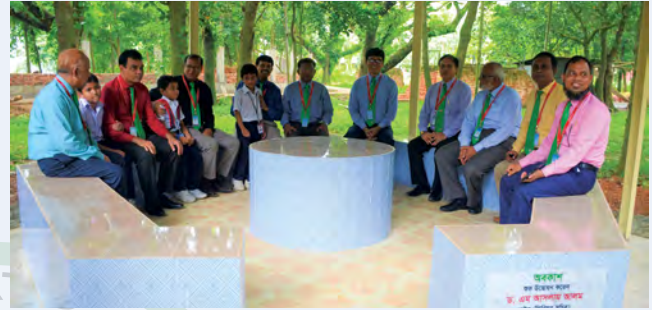
Officials of BPATC are being seen in the Social Meeting Place "Obokash" which has been inaugurated recently

BPATC is always concerned about its social responsibilities to provide a better environment for the officials and their family members. Two waiting corners (Obhivabok Ongon, Protikkhaloy) in front of the Gate No-1 for the guardians and others, and two meeting places (Obokash, Lakeview) in residential area for the officials of this centre were inaugurated at that time.