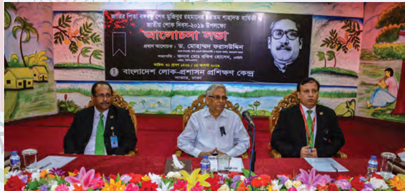
Discussion on National Mourning Day

In observing National Mourning Day 2019, BPATC took several activities. We started the day by hoisting the National Flag half-mast. Many banners were hung up throughout the office area. Few LED screens were put on the main gate, over-bridge and main reception of the centre to show documentaries on the life of Bangabandhu Sheikh Mujibur Rahman.