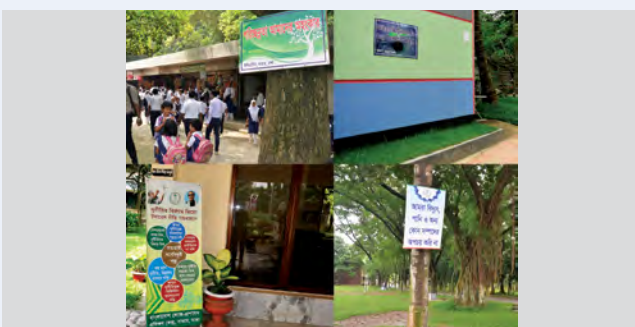
Displayed Banners in the different places of the campus of BPATC to create awareness