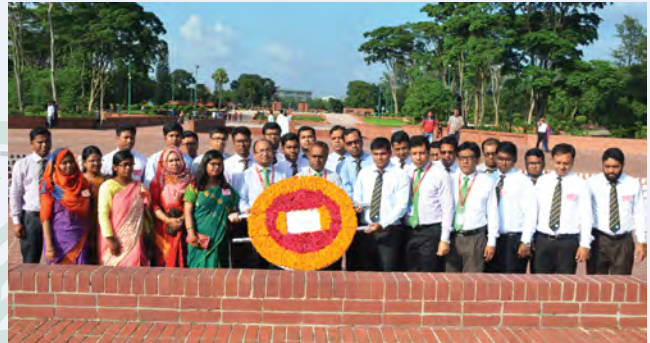
Participants of the 4 th SFTC for the officials of LGED is paying tributes to the National Martyrs at the National Mausoleum, Savar

On request of other organizations, BPATC arranges 2-month long Special Foundation Training Courses (SFTCs) for the officials of different government organizations. From 25 August to 23 October, 2019 BPATC conducted SFTC for the officials of Grade 9 of Local Government Engineering Department. LGED is actively and deeply engaged with the development of rural infrastructure. Foundation Training provides them a broader spectrum in working in the bureaucracy.