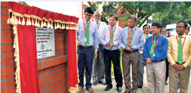
Former Rector is also inaugurating the construction work of Nature Observation Centre