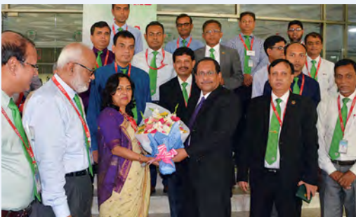
New Rector is being received by the Faculty on the first day at the centre

office. All faculty members, officials and employees were present in order to show him respect and recognition for his contribution to strengthen BPATC as apex training institution. BPATC will remember him as contributor like the rectors since its beginning.