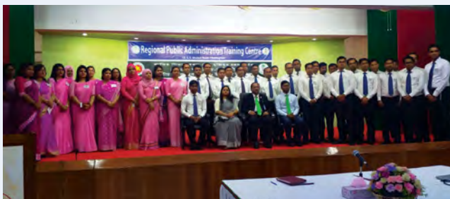
Rector, BPATC is with a group of participants of 68 th FTC conducted at RPATC, Chattogram

Within the described timeframe, this centre had organized 4 Fundamental Training Courses with 224 participants along with other miscellaneous courses by achieving almost two-thirds more of its expected target. This centre became one of the proud venues of 68 th Foundation Training Course for 44 participants of 8 different cadres. Vibrant faculty members including respectable Rector of BPATC also visited RPATC and conducted important sessions. Rector, BPATC was the principal discussant on the occasion of observing the National Mourning Day at RPATC, Chattogram.