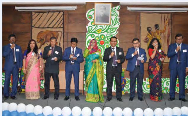
Participants performing on Cultural Night

The participants of 125 th ACAD also arranged sports day and cultural night like other courses.