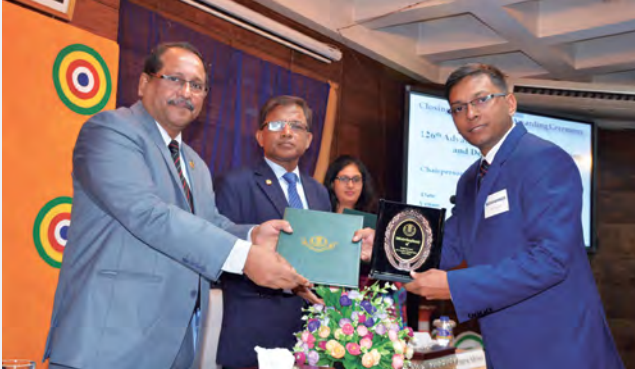
Rector, BPATC is handing over the Certificate of Excellence and Crest to one of the three best participants of 126 th ACAD

126 th ACAD: The 126 th Advanced Course on Administration and Development (ACAD) was conducted from 21 July to 28 September 2019. The number of officers attending this two-month-long course was 36 including 5 females. Among them, 34 officers were Deputy Secretaries to the Government of Bangladesh, and 2 belonged to Bangladesh Armed Forces Division. Participants of this course had the opportunity to visit Vietnam for ten days (10-19 September 2019) as part of a regional exposure visit (REV). They also arranged a colorful cultural evening during this visit.