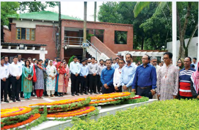
The Participants of 69 th FTC are offering flower wreath on the mausoleum of the Father of the Nation Bangabandhu Sheikh Mujibur Rahman

The 69 th Foundation Training Course (FTC) was conducted from 17 April 2019 to 13 October 2019 in BPATC. In this 6 month-long training course 395 cadre officers including 84 females from 37 th BCS have successfully completed their foundation training. On 26 September this course along with the CMT members paid a visit to the mausoleum of Father of the Nation Bangabandhu Sheikh Mujibur Rahman. They showed their tribute to 'Father of the Nation' before starting their job at the field level and took the oath to fulfill the dream of 'Golden Bengal' of the founder of this country.