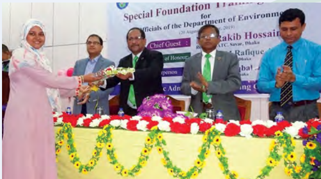
A participant is offering flower bouquet to the Rector in the Inaugural Ceremony of SFTC in RPATC, Dhaka

Having the target to provide training to 250 officials of 10 th to 20 th grade, the regional centre (RPATC) at Dhaka could successfully arrange various trainings for 406 officials of different grade including the officials of 9 th grade on the contrary. These courses include Fundamental Training Course, Conduct and Discipline Course, E-nothi Course, Office Management & ICT Course etc. which are also common for other regional training centres. Moreover, this centre had organized a Special Foundation Training Course for the officials of the Department of Environment (DoE) where the number of participants was 39 (male 34, female 05).