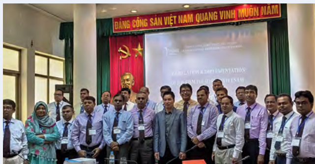
Participants are attending sessions at Vietnam

The feedback seminar on that visit was held on 27 August. The intension of arranging this is to learn from regional exposure visits (REV) and to provide participants an opportunity to share experiences of policies, strategies, and practices in the public service delivery system with their counterparts in the visiting country. Presenting the group report was the final activity for the participants and therefore, they were awarded with their successful course completion certificates.