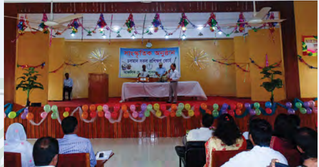
Cultural program by the participants of a training course in RPATC, Rajshahi

Throughout July, August, and September, this centre followed the regular training courses enlisted in the training calendar for RPATCs. They organized altogether 10 courses among which 3 in the month of July and August each and 4 were in the month of September with the participation of the officials of grade 20 to 10. They achieved 123.20% (308 participants) of their fixed target (250 participants). Altogether they trained 252 male and 56 female officials of Rajshahi and Rangpur Divisions.