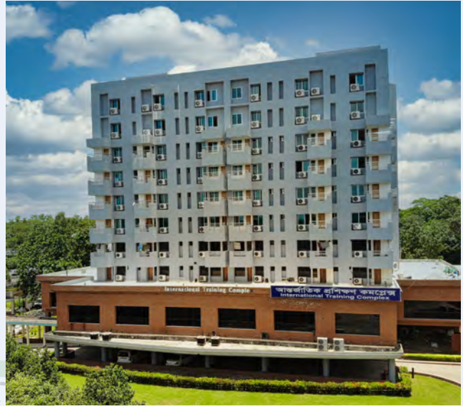
ITC building; after the completion of vertical extension

For imparting quality and international standard training to the members of the Bangladesh Civil Service through its four core courses, it is important to instruct contemporary pedagogy and to enhance the capability of the educator.