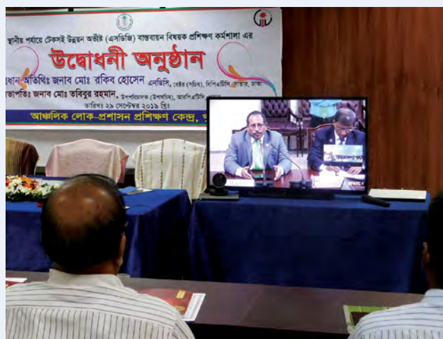
Rector, BPATC is inaugurating a training course in RPATC, Khulna through live video conference

BPATC is one of the proud institution in the country which performs a significant portion of its activities through e-Communication among which meetings and sessions with the Regional Centres, Video Conferencing with Ministries and other stakeholders, procurement through E-GP system, File Processing through E-Nothi etc. are worth mentioning. The whole of the academic and office area have been brought under WiFi connectivity. Most of the official correspondences are being done electronically. The centre is incessantly promoting its e-communication.