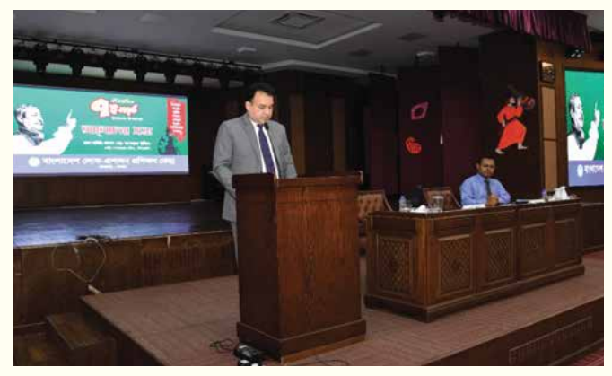
Respected Rector of the Centre delivering his speech on the occasion of Historic 7th March

Last but not least, documentaries on the Father of the Nation are screened on LED display boards throughout the day.