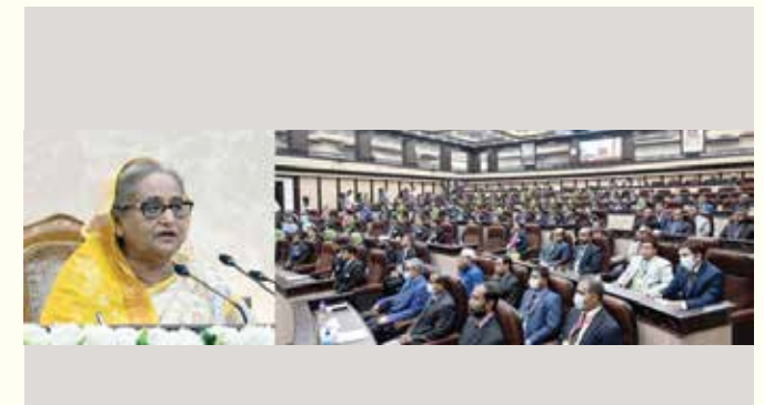
Hon'ble Prime Minister Sheikh Hasina, MP is giving her remark in the certificate awarding and closing function of 74th FTC.