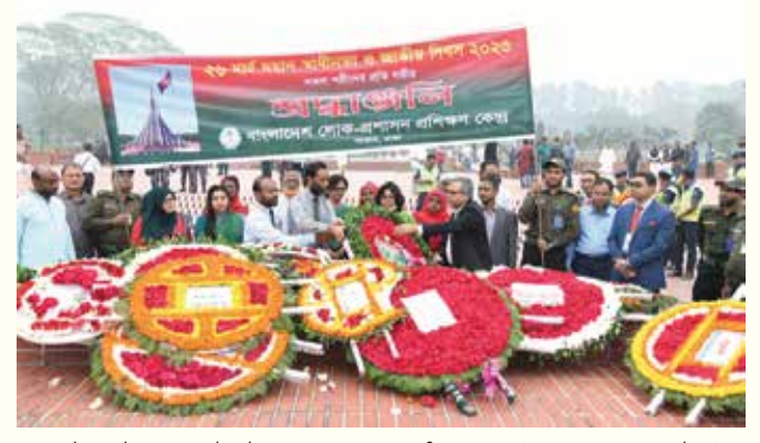
Faculty along with the participants from various courses placing floral wreaths at the National Mausoleum

The Programmes dedicated for the event actually started at a day earlier on 25th March with the students of BPATC School and College participating in a discussion programme on 'Genocide Day" as well as one minute black out at night from 10:30 to 10:31 by the concerned committee.