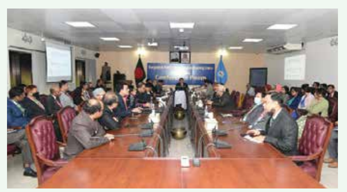
Introductory meeting between Rector and faculty members of BPATC